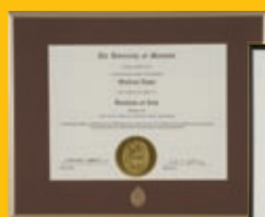
FROSTED GOLD Single Mat

You'll appreciate these sturdy, Canadian-made frames which were specially designed to ENHANCE YOUR DEGREE OR PHOTOS in seconds - without the use of any tools!