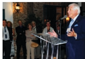
Special guest Monty Hall speaks to the crowd.