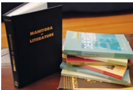
Mosaic through the years