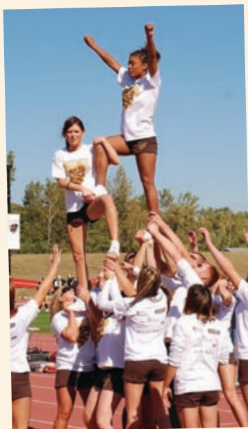
Bison cheerleaders fire up the crowd.