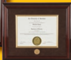
DIPLOMAT PLUS suede mat w/ gold fillet & gold medallion