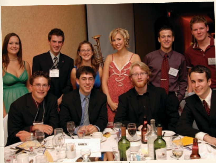
Members of the University of Manitoba Engineering Society council strike a pose.