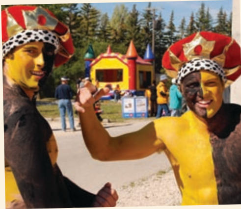
Bison fans wear their brown and gold pride on their sleeves... chests... necks...

A Bison win, an engineering centennial, a reunion dinner 600-strong and a luncheon that brought together graduates from seven decades ago. These were just some of the events that made Homecoming 2007 a week to remember.