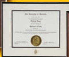
BLACK METAL Double Mat