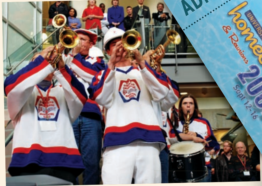
The engineering band provided the soundtrack to Homecoming 2007.