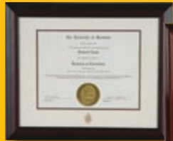
BRIARWOOD Double Mat