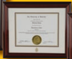
DIPLOMAT Triple Mat