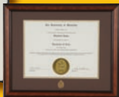
DARK WOOD Double Mat