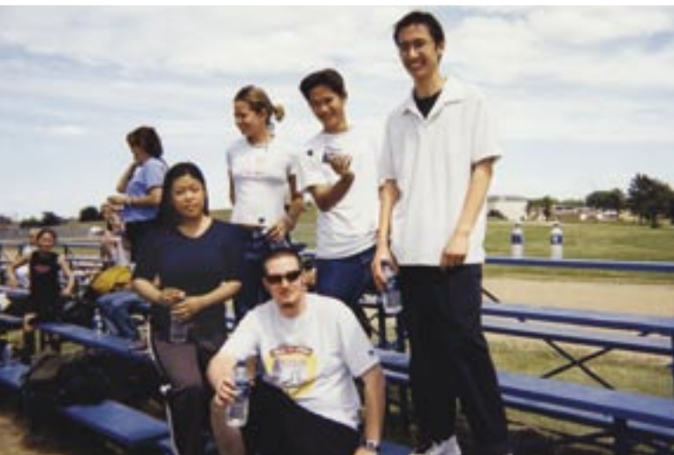
Students at BizCamp 2003

says. So, as a public service, the centre trained 25 reservists from across Canada that were being sent to the cities of Grozny and Behach last March to help rebuild the economy.