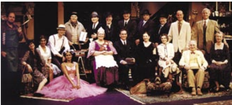
2003 MBA/MTC Joint Production of You Can't Take it With You