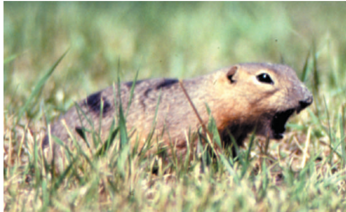
Figure 1 Careful whisper: a ground squirrel making an ultrasound call as a covert signal of danger.

Part from echolocation and the pursuit of prey by bats 1 , the function of ultrasound in animal communication is poorly understood 2 . This is mainly because of the broad range of responses that it can evoke and the widely varied contexts in which it is used (for example, in rodents of the Muridae family it may indicate distress in infants or a sexual or predatory encounter in adults) 3 . Here we find that a purely ultrasonic signal is produced in the wild by a rodent of the Sciuridae family, Richardson's ground squirrel, and show that its function is to warn conspecifics of impending danger. To our knowledge, ultrasonic alarm calls have not previously been detected in any animal group, despite their twin advantages of being highly directional and inaudible to key predators.